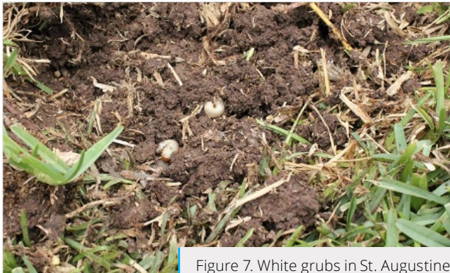
Figure 7. White grubs in St. Augustine.

threshold for white grubs is 5 to 10 grubs per square foot. Therefore, treatment for white grubs is not appropriate in all sites. Depending on the time of year, multiple types of chemical treatments may be appropriate. These include preventative, curative (grubs present but no damage), and rescue (damage present).