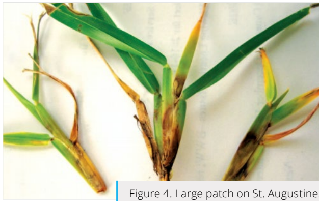
Figure 4. Large patch on St. Augustine.

had chronic disease pressure. Typically, fungicides will be the most effective when applied preventatively in the fall before disease symptoms are visible.