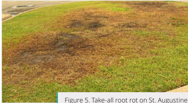
Figure 5. Take-all root rot on St. Augustine.

Take-all root rot is a fungal disease that lives in the soil. With a soil-borne pathogen, cultural practices are the most important aspect for management. Disease activity can be seen throughout the year if turfgrass is stressed but is most prominent when turfgrass is coming out of dormancy in the spring and early summer. Symptoms first appear as chlorotic leaves that eventually turn brown and wilt. As the disease progresses, turfgrass will thin out, leaving brown, irregular-shaped patches that can range from 1 to 20 feet in diameter. Roots of infected grass are usually short, blackened, and rotten; this makes it very easy to lift stolons from the soil. Weakened roots make plants more prone to drought stress. During active disease periods, this fungus usually does not easily transmit on equipment, but limiting the spread of infected plant parts is a good practice. Take-all root rot is more likely to develop under alkaline soil conditions (pH >7). Cultural management includes promoting proper drainage, deep and infrequent irrigation, balancing fertility, and acidifying the soil. Acidifying amendments such as compost, peat moss, and select sulfur-containing amendments can be used independently or when performing cultural