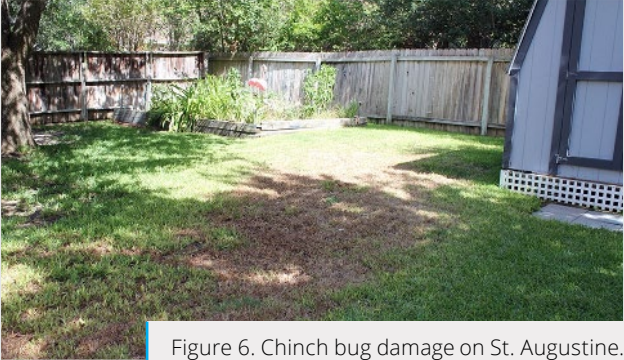
Figure 6. Chinch bug damage on St. Augustine.

Chinch bugs are a common pest of St. Augustinegrass and range in size from approximately 0.2 to 3 millimeters. Chinch bugs are most commonly seen in the summer when the weather is hot and dry. Although all life stages of chinch bugs can be found in the thatch layer, nymphs do damage to the grass by feeding on plant sap and potentially injecting a toxin that will ultimately result in plant tissue death. If this is left untreated, damage can be quite severe and cause large irregular patches of yellow to dead turfgrass. These symptoms can easily be mistaken for drought stress or other disease symptoms. While there is no preventative chemical control of chinch bugs, preventing significant damage is possible with scouting and monitoring for chinch bugs. This can be done by pulling back areas of the turfgrass canopy close to a driveway or damaged area and inserting a 6-inch-diameter coffee can 2 inches into the ground, filling it with water, and watching the insects float to the top. The treatment threshold for chinch bugs is 25 bugs per square foot.