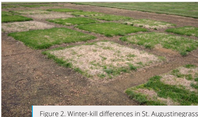
Figure 2. Winter-kill differences in St. Augustinegrass.

Best establishment guidelines are that warm-season turfgrasses be planted during warmer months when they are actively growing to promote quick and successful establishment. Ideally, St. Augustinegrass should be planted in the late spring and early summer to avoid temperature extremes. This time of year will also often offer greater natural precipitation to aid in establishment compared with drier months in the late summer. While St. Augustinegrass sod can be planted year-round in many parts of Texas, it is important to be mindful of how environmental conditions during other parts of the year may influence the success of establishment. Allow as much time as possible for turfgrass roots to develop prior to fall and winter frosts. St. Augustine is susceptible to winter-kill in some parts of Texas, and successful establishment is vital for winter survival.